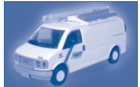
The vans are custom made with the official logos of PECO, PGW and the Philadelphia Water Department.